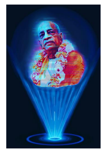
The RtVik Hologram